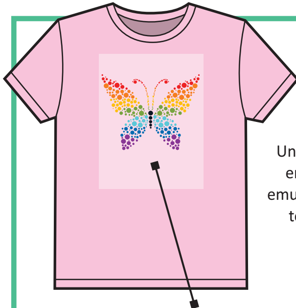
Ink Jet Emulsion Layer

Continue to check back with us at conde.com/reveal for the most current instructions and updates