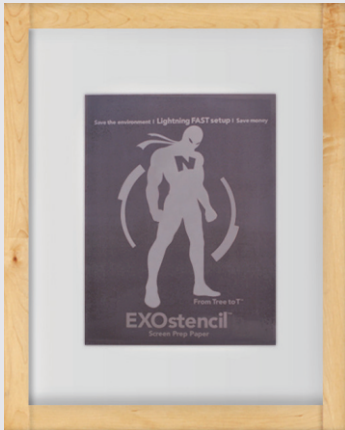
Produced with: EXOSTENCIL Screen Prep Paper

EXOSTENCIL Screen Prep Paper is a revolutionary, environmentally friendly, Chemical Free way to make and reclaim screens. This simple, two step process eliminates the need for big investments, allowing you to get into production in just minutes. This process for manufacturing screens is appropriate for mesh counts from 85 -230.